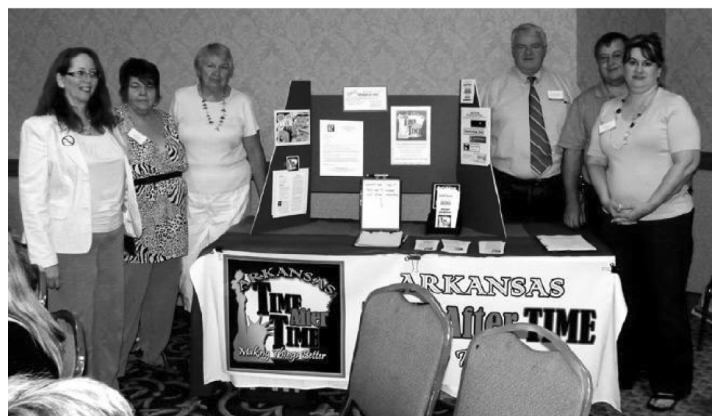
Conference attendees from Arkansas Time After Time.

Overall, it was exciting conference and I definitely plan to attend next year's RSOL Conference in Albuquerque, New Mexico, September 7 - 10, 2012. Please visit http://www.reformsexoffenderlaws.org/ for more information. ■